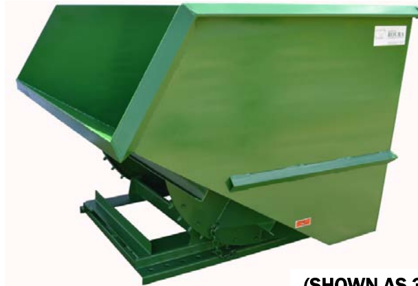
(SHOWN AS 3T-3/16-1080)