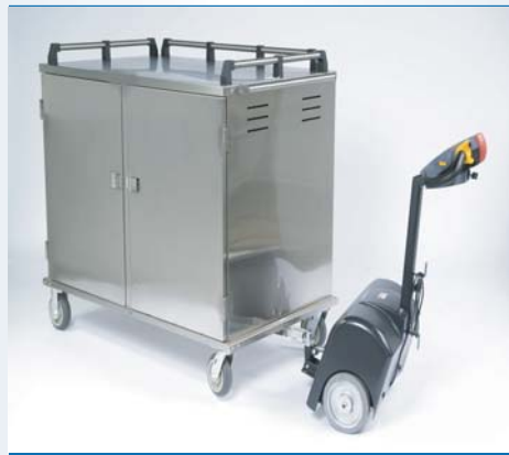
Moto-Tugger Pulling Single Cart