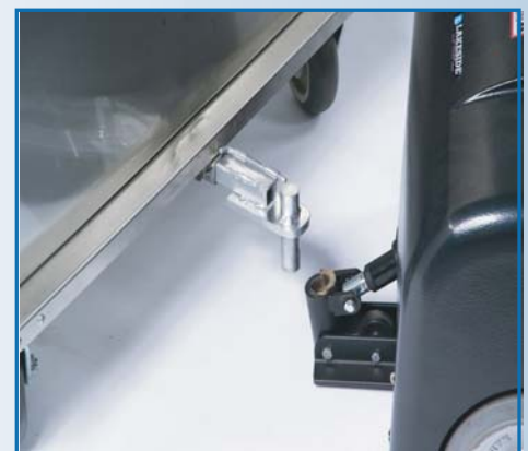
Quick Hitch Lift System