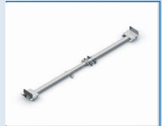
4752 & 4753 Receiver Tube