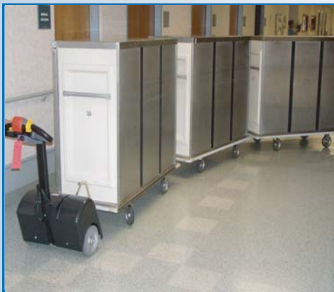
Moto-Tugger Pulling Multiple Carts