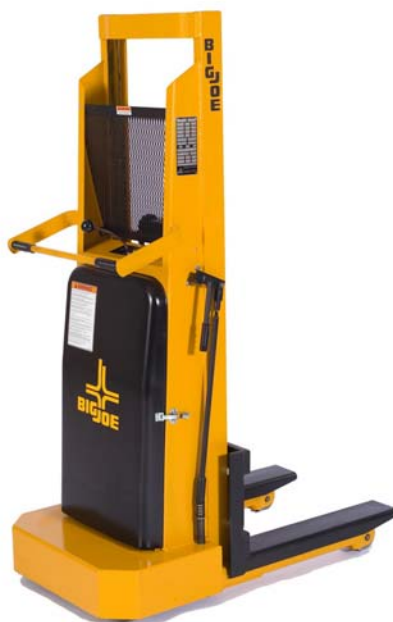
IBH 1518-R6 SHOWN WITH RIGID FORK CARRIAGE AND REMOVABLE LOAD PLATFORM

Lift motor is specially selected for peak efficiency at torque and RPM lift pump requirements. All cables and wiring are color-coded and/or numbered for easy servicing.