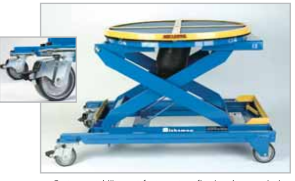
Caster portability cart features two fixed and two swivel casters with brakes. Inset is close-up of swivel casters.