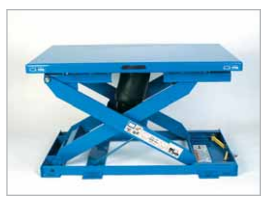
Bishamon EZ Loader with rectangular narrow non-rotating top.