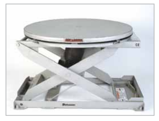
EZ Loader constructed of 304 stainless steel for food and washdown applications.