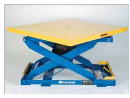
Bishamon EZ Loader with solid rectangular rotating top.