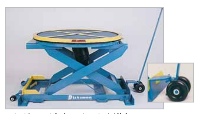
Semi-live portability for moving unloaded lift features two wheels and a dolly handle. Inset is close-up of dolly wheel unit.