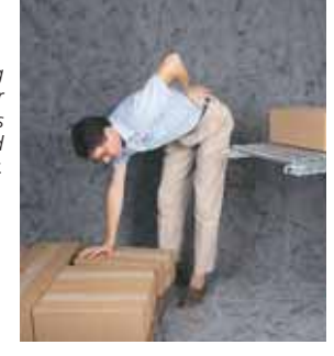
Loading / unloading pallets on the floor takes more time, causes worker fatigue and often leads to injury.

The EZ way keeps the work at a convenient height eliminating bending. The rotator ring minimizes walking and stretching.