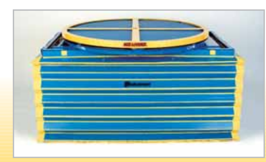
The Bishamon accordion bellows skirting.