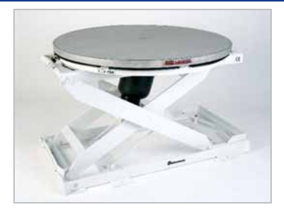
EZ Loader with wash-down package consisting of USDA accepted paint and stainless steel rotating platform.