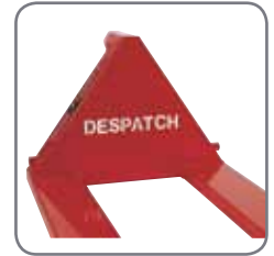
The company name or logo can be cut out in the triangle of the Thork-Truck.