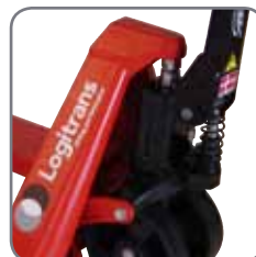
Permanent quick lift.