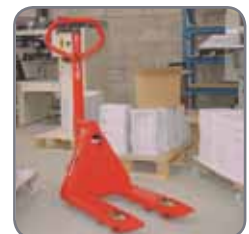
Thork-Truck is available with different fork lengths.