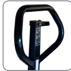
Ergonomic handle ensures the user a relaxed hold. Can be marked with name/department.

Stainless and explosion proof pallet trucks are also available.