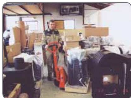
An easy handling of goods is ensured even in very confined spaces.