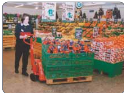
Adjustable fork height - no problems when handling low and worn pallets.