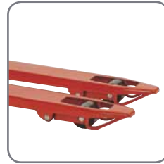
The hoop skates on the forks ensure an easy fork insertion and withdrawal in/out of pallets.