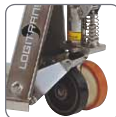
Different wheel types, to suit the needs of the user.