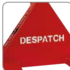
Can be marked with name/department.