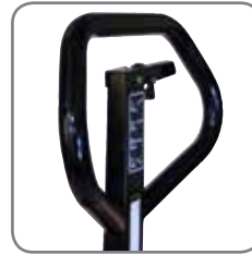
Ergonomic handle ensures the user a relaxed hold.