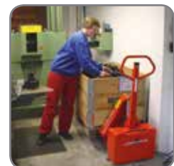
Patented cylinder construction gives low overall height.