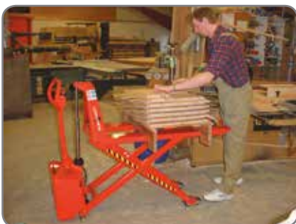
Optional extras: remote control, level control and brake.