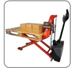
Level control (optional extra) ensures a constant working height.