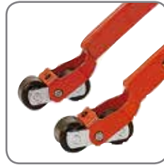
The tandem wheels have a brake effect and are not hostile to the floor.