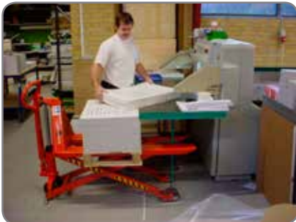
The manual highlifter needs very low power for the pump function and has foot protection and neutral position.