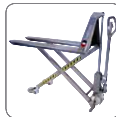
Available as manual, electric and stainless.