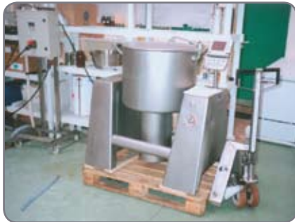
RF-PLUS - for the food industry and the pharmaceutical industry with strict hygiene and sanitation requirements.