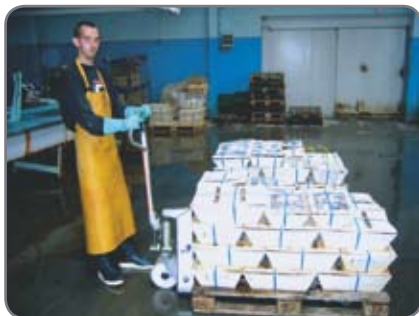
RF-SEMI - for the food industry in areas, where hygiene demands are not so high, but corrosion resistance important.